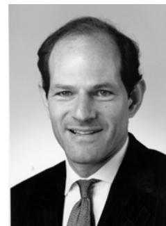
ELIOT SPITZER Attorney General April, 2004